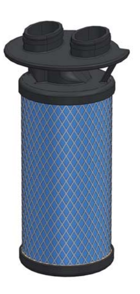
Depth Filter UltraPleat® M