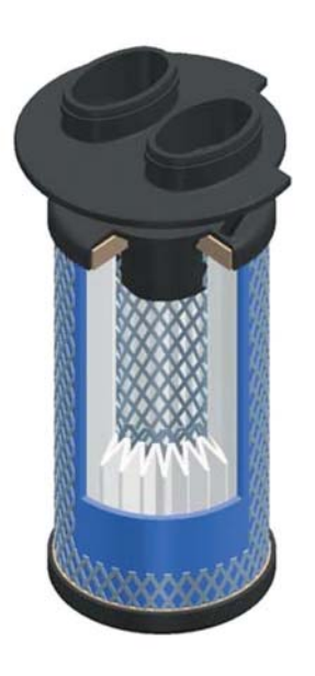
Cross section of the depth filter

The UltraPleat® M filter element is designed and developed for the following applications: