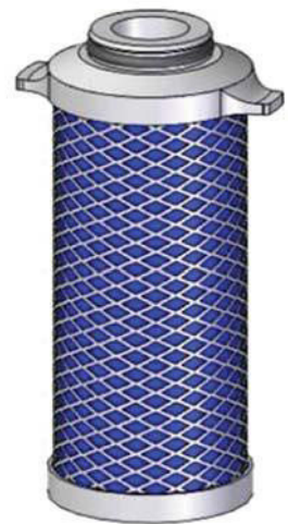
Depth Filter SX