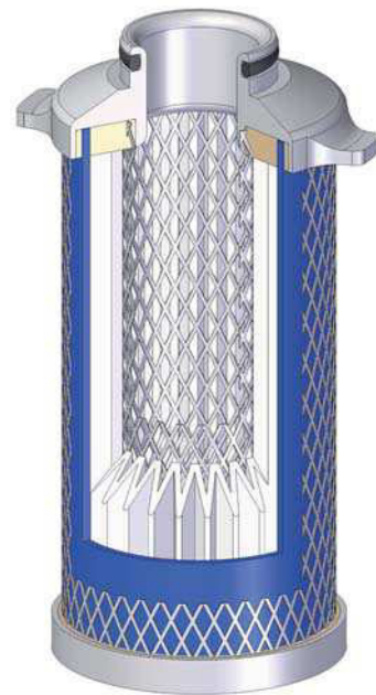
Cross section of the depth filter

By utilising various filtration mechanisms such as retention by direct impact, sieve effect and diffusion effect, liquid aerosols and solid particles down to the size of 0.01µm are being retained in the filter.