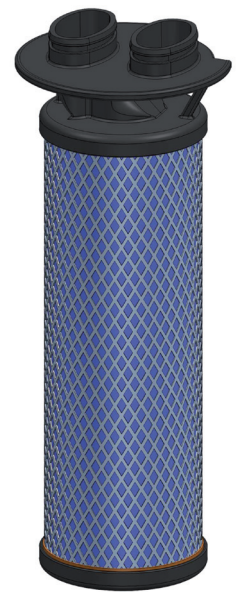
Depth filter V